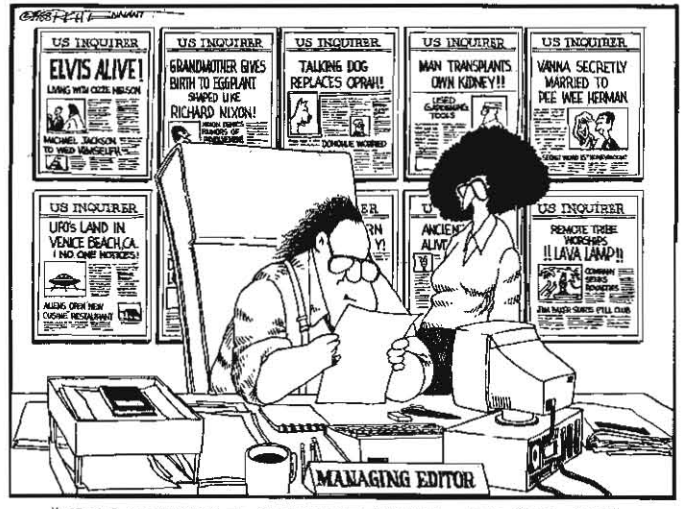
"APPLE COMPUTER TO DISCONTINUE APPLE II, ... O.K., GO WITH IT."

Markets and Uses. In a press release announcing the product, Apple said it expects the card to be used primarily in elementary and